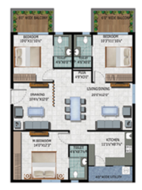
8. WEST FACING 3BHK | 1740 SQ.FT