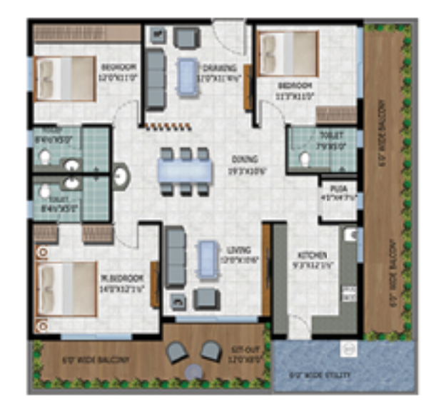
4. NORTH FACING 3BHK | 2340 SQ.FT