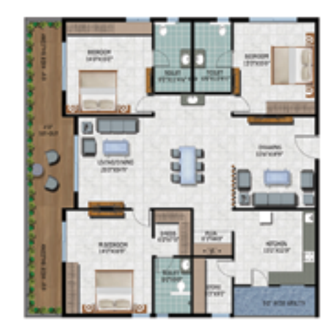
8. EAST FACING 3BHK | 3010 SQ.FT