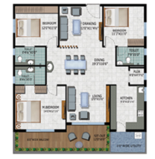
5. NORTH FACING 3BHK | 2015 SQ.FT