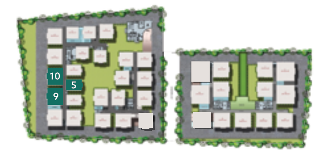
9. EAST FACING 3BHK | 2205 SQ.FT