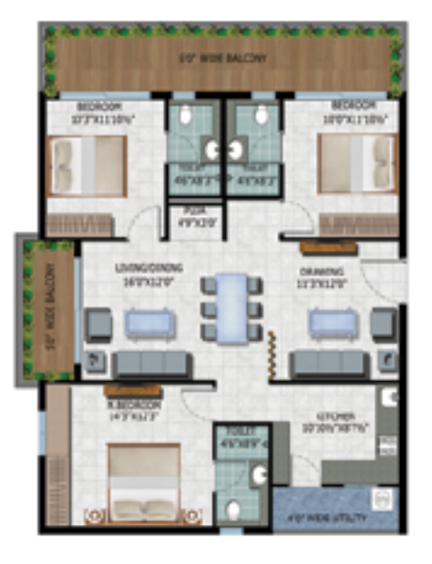
7. EAST FACING 3BHK | 1850 SQ.FT