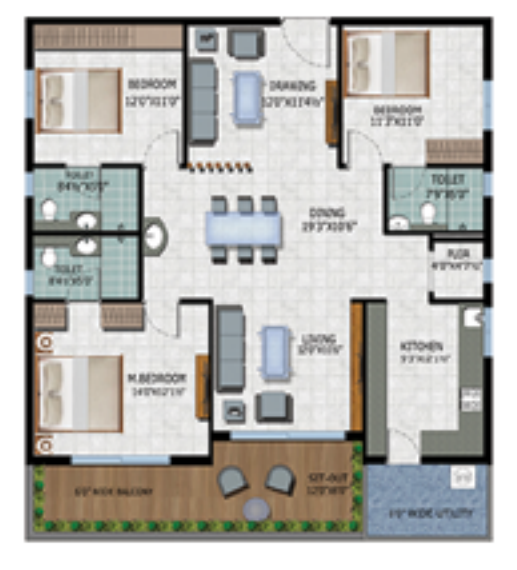
6. NORTH FACING 3BHK | 2015 SQ.FT