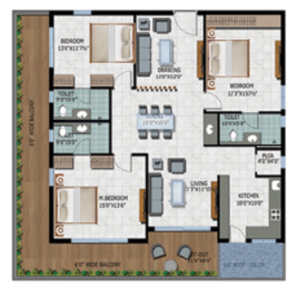
7. NORTH FACING 3BHK | 2510 SQ.FT